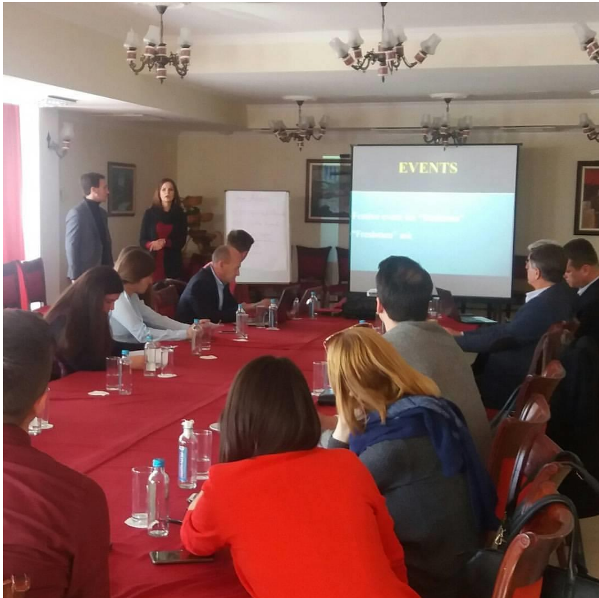
Picture 1: Presentation of the intermediate results by project staff from the University of Nis.